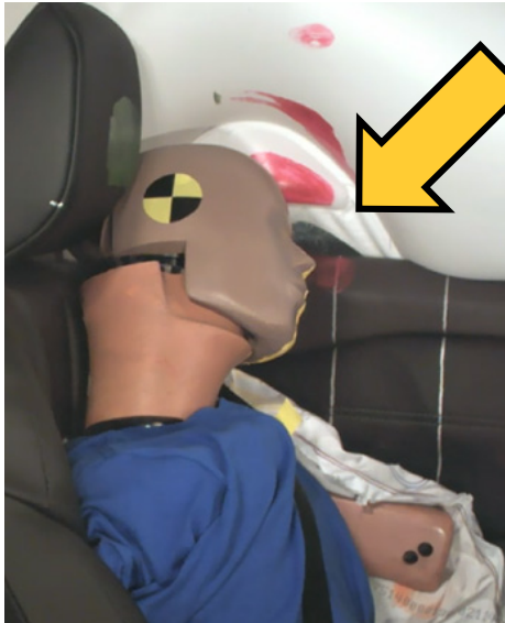
Figure 2 Example of Marginal Head Protection